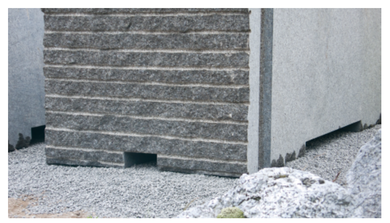
About Mum's Children / details / language of mining