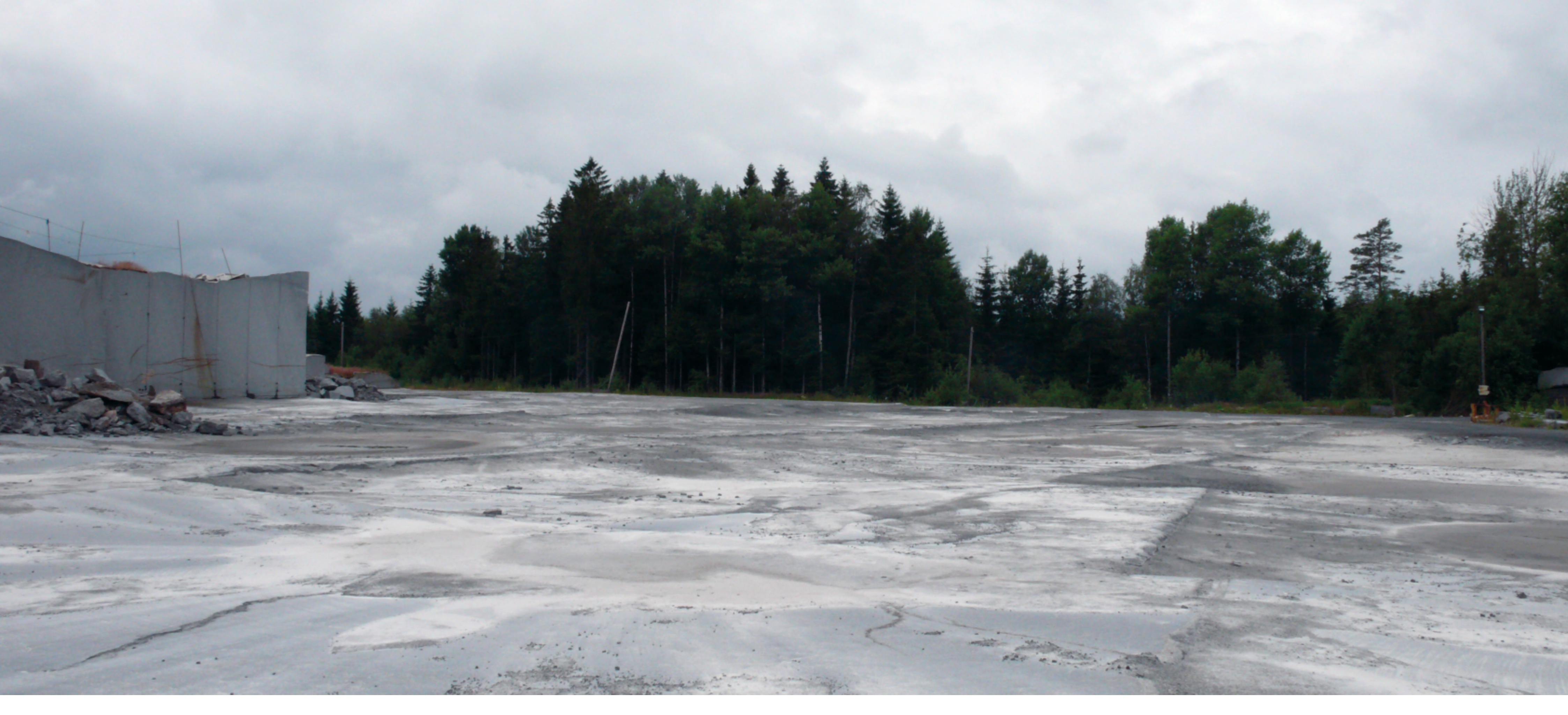
Quarry Håkestad / Norway